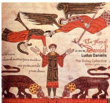
The Dufay Collective: Ludus Danielis. The play of Daniel .

- Wy wullen alle vrolick syn / We all want to be joyful . Musik aus dem Kloster Ebstorf / Music from Ebstorf Convent . Ensemble Devotio moderna. CANTATE C 58034 (2008). € 15.