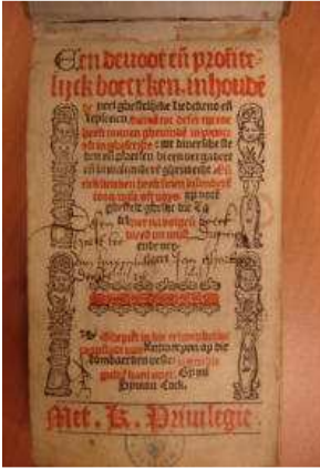
Devoot ende profitelijck boeckken, Antwerpen 1539

NETHERLANDS ORGANISATION FOR SCIENTIFIC RESEARCH (NWO) HAS GRANTED A SUBSIDY TO THE PROJECT DUTCH SONGS ON LINE IN FEBRUARY 2009.