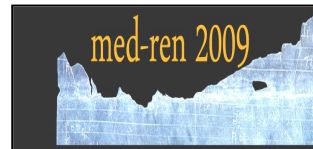
Medieval-Renaissance Music Conference 2009

STUDY DAY: HISTORIOGRAPHICAL TOPICS IN MUSIC ARCHAEOLOGY AND ETHNOMUSICOLOGY.