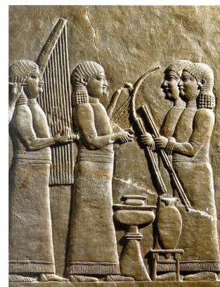
Palace orchestra of Nineveh depicting a lyre, a harp and a double oboe, ca. 704-682 B.C. London, BM, Inv. Nr. 124922